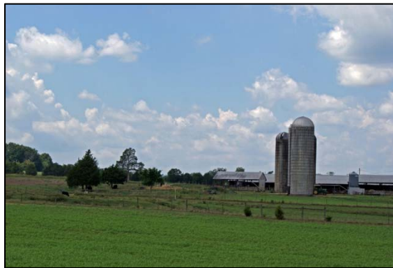
Farm in the Flat Creek Watershed