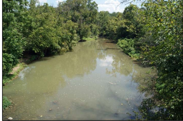
Flat Creek South of Old Rutledge Pike

South of Rutledge Pike the landscape changes. Legacy mining operations altered the creek causing water to back up and slow down as evidenced by the picture to the right. This area in the lower end of the watershed contains Eastbridge Industrial Park. In addition to housing commercial and industrial plants there is a 400+ acre gravel mining operation. After passing through this area, Flat Creek flows under Mascot Road and empties into the Holston River.