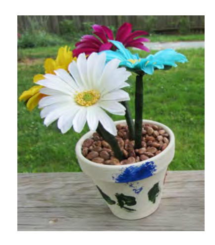
Tuesday, Apr 2nd 10 AM Flower Pens All supplies provided.

Bring wide mouth jar. Other supplies provided