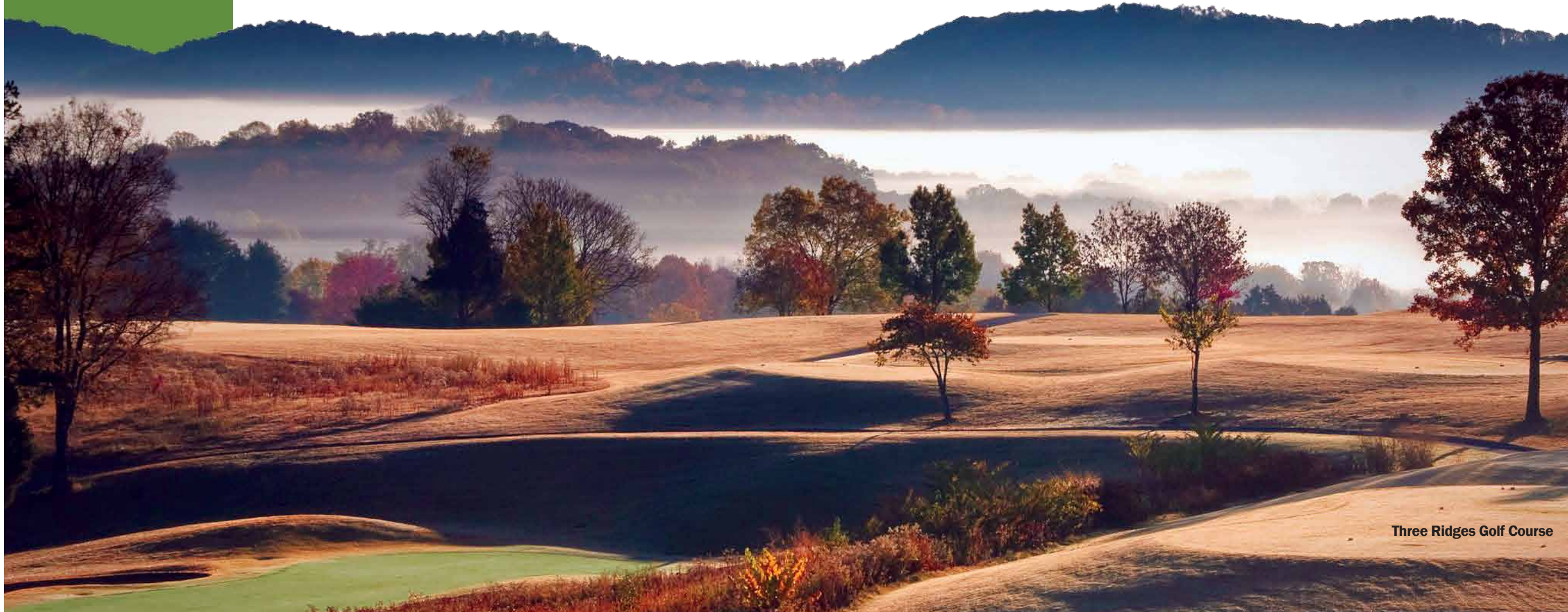
Three Ridges Golf Course