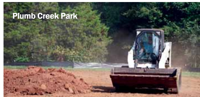
Plumb Creek Park