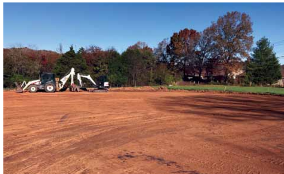
Plumb Creek Park