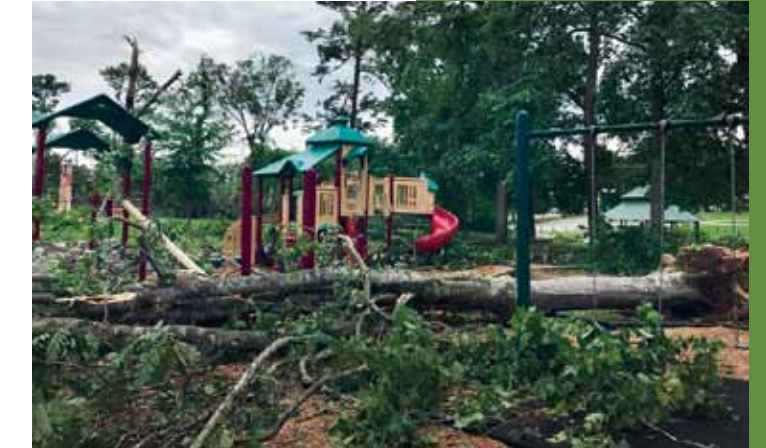
Concord storm clean-up