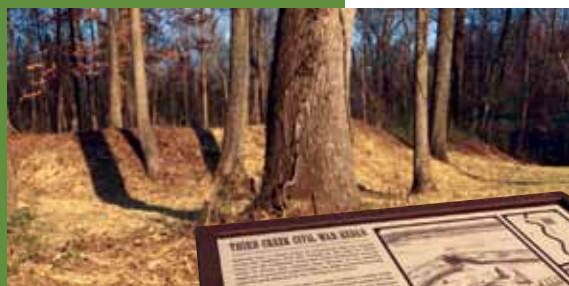
Civil War redan