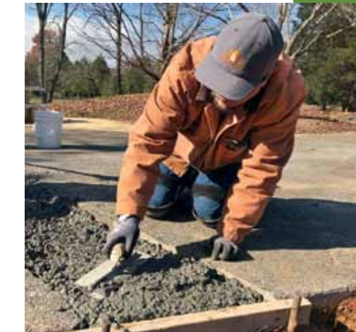
Ball Camp Park