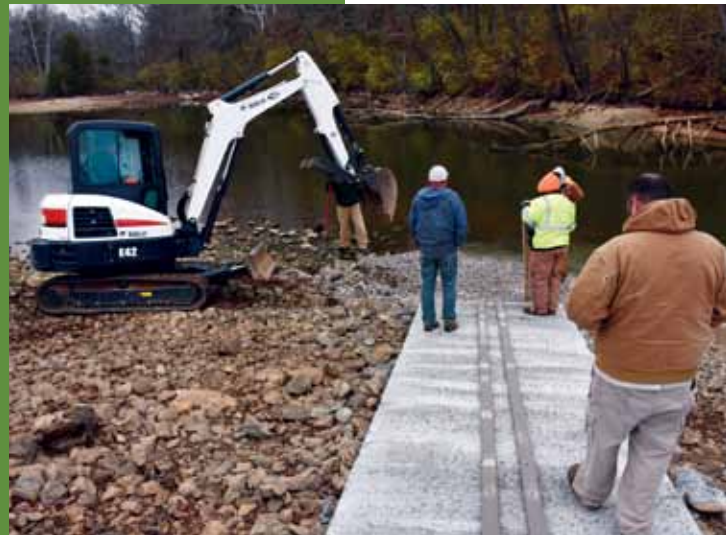
Concord Park, kayak/canoe launch