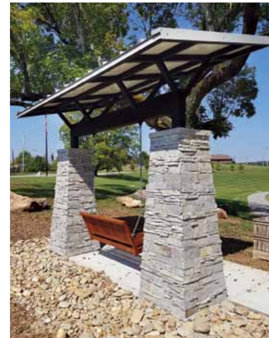
Clayton Park memorial swing