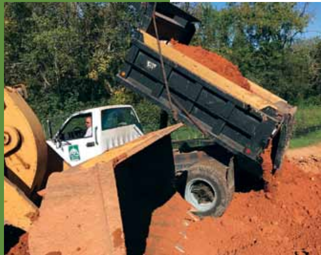
Plumb Creek Park