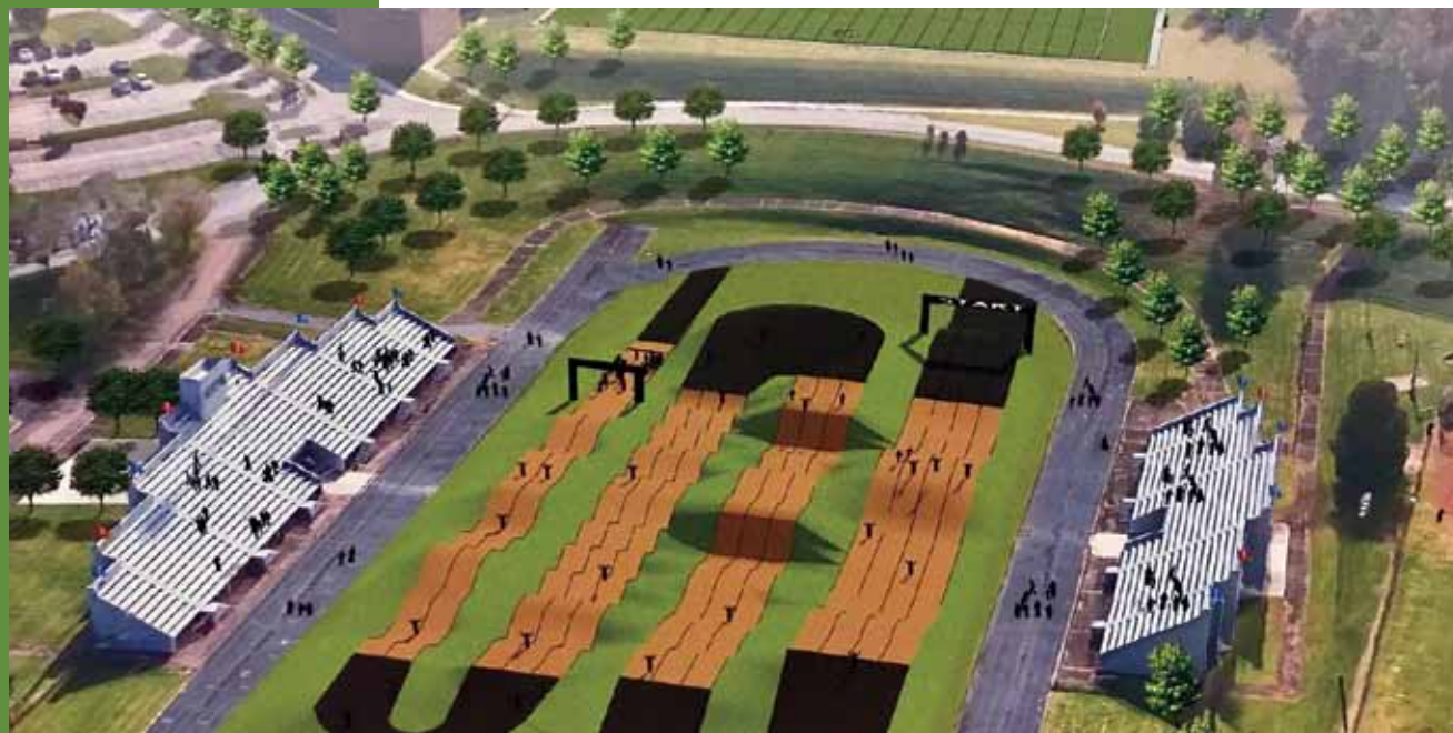
BMX Track/South-Doyle Middle School fields