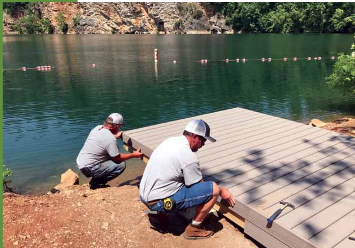
Dock, fencing and parking lot at Mead's Quarry