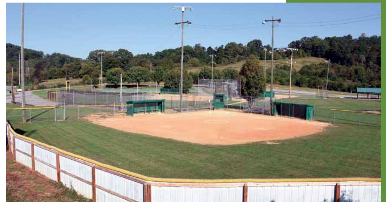
New slope and fence repairs, scoreboards and lights at Bower Field